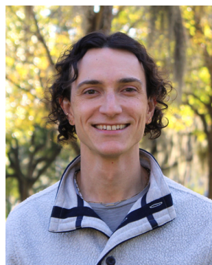
Ryan F. Need

With regards to manganite perovskite CCOs, nearly all studies to-date have been on charge-doped compositions, where the A-site valence deviates from the trivalent A 3+ studied here and causes a mixed Mn 3+ /Mn 4+ valence and double exchange ferromagnetic ground states. 14,15,23,24,26–28 Across the charge-doped manganite CCO studies, the clearest common result thus far is that increasing the variance of the ionic radii of the A-site ions monotonically decreases the B-site ordering temperature. Good examples of this are seen in complementary studies by Sarkar et al. , 23 on manganites with varying degrees of charge doping but a fixed (5A) composition, and Das et al. , 15 on manganites with fixed doping but different (5A) compositions, both of which demonstrated changes in B-site ordering temperature that were monotonic with A-site ionic radii variance. Beyond structural tuning of B-site ordering temperature, Kouki et al. 27 observed that A-site radii variance and increasing Sm content could change the universality class of their ferromagnetic order parameter, indicating that the character of B-site ordering can also be influenced by A-site alloying. However, the authors still correlated this subtler effect