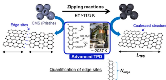
Fig. 1 Schematic of HT of CMS and the accompanied graphene-zipping reactions. The advanced temperature-programmed desorption (TPD) is used to quantify the carbon edge sites and calculate the average graphene-domain size ( L_{\text{TPD}} ).

Herein, the structural evolution of CMS is thoroughly analyzed by various methods, including transmission electron microscopy (TEM), N 2 gas adsorption, powder X-ray diffraction (PXRD), Raman spectroscopy, advanced temperature-programmed desorption (TPD) up to 2073 K (Fig. 1), neutron scattering, H 2 O-vapor adsorption, solid-state 13 C-NMR, soft X-ray emission spectroscopy (SXES), and magnetic susceptibility measurement using a superconducting quantum interference device (SQUID). Moreover, structural properties relationships are examined, focusing on their thermal stability in the air, electrochemical stability, elasticity, and electric conductivity. This study delves into a profound comprehension of the intricate molecular-level structural transformations that transpire during the process of zippering reactions amid graphene sheets at a temperature range from 1273 K to 2273 K. The findings furnish a roadmap towards attaining coveted attributes in ubiquitous porous carbon materials and other carbonaceous frameworks via HT, thereby propelling the advancement of superior porous carbon materials.