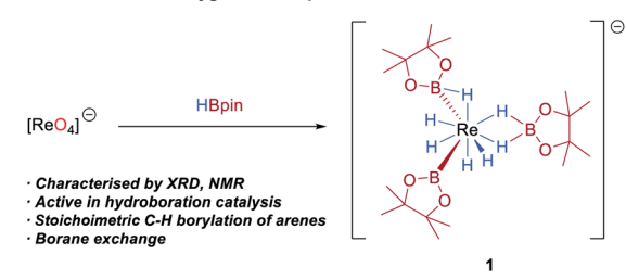
Scheme 1 (A) Selected examples of complexes with boron-centred ligands. (B) This work: synthesis of a rhenium boron-polyhydride anion from HBpin and KReO<sub>4</sub>.

and air-sensitive reagents and are limited to low oxidation-state Re centres. Furthermore, rhenium (poly)hydrides are typically synthesised from Re oxides under forcing conditions such as sodium in EtOH17 or by the reaction of a rhenium (oxo)halide with a main group metal hydride such as LiAlH4.18