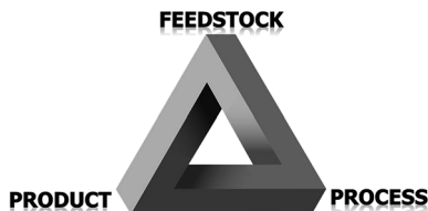
Fig. 1 Penrose triangle for a fossil-to-bio transition.

latest developments in science and technology that address those questions and challenges and create new opportunities.