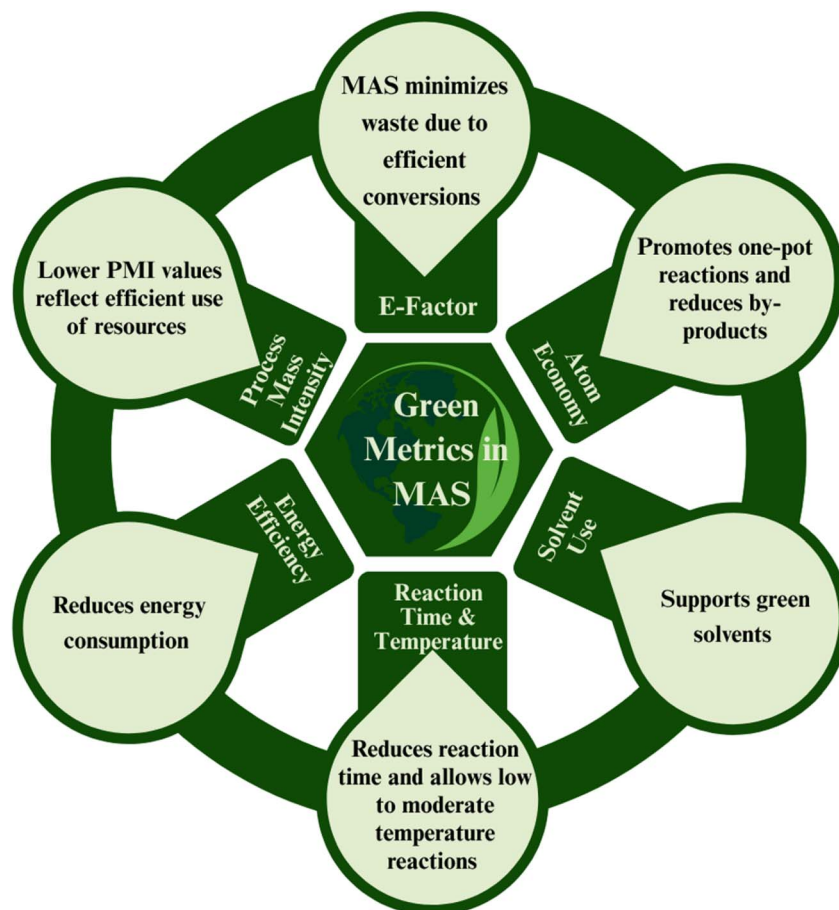
Fig. 6 Green metrics involved in MAS.

In alignment with the green chemistry principles, a set of rules meant to support environmentally friendly and financially viable chemical operations, MAS provides a cleaner, more sustainable pathway for the synthesis of nanomaterials by