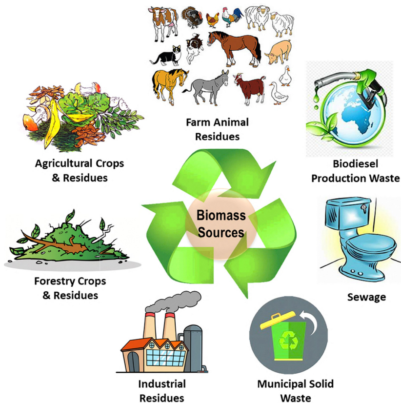
Fig. 1 Renewable sources of biomass.

can have significant environmental, economic, social, and sustainability implications. The utilization of biomass offers numerous environmental advantages, including reducing greenhouse gas emissions, promoting waste reduction and recycling, and providing an alternative to fossil fuels. 5 The implementation of effective waste management strategies that prioritize resource recovery, recycling, and utilization of biomass can help mitigate these impacts and promote a more sustainable approach to biomass management. 6