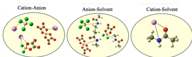
Fig. 2 Schematic of the interactions: cation-anion, anion-solvent, and cation-solvent.

From the RDFs (Fig. 3(a)–(c)), we observe that the lithium cation primarily interacts with the oxygen atoms of the DFOB and the BOB anions, with strong Li–O peaks at approximately 2 Å, indicating highly localized first cation coordination shells. The highest cation-anion pCN is observed in the LiBOB-based DEE (2.5), followed by the LiDFOB-based DEE and then the LiBF 4 one (1.4) (Fig. 4). This trend follows the anion size and available coordination sites: BOB > DFOB > BF 4 − .