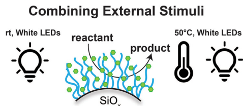
Fig. 1 Illustration of the overall idea of combining both thermal and light responsive features on a surface.

access to the active sites through external stimuli. 33,39–44 Despite their promise, only a few limited examples of multi-responsive organic heterocatalytic photoactive materials exist. 43,45 Their limitations include inadequate solubility 46,47 or limited synthetic versatility. For polymer-based photocatalysts, separating a synthetic product the photocatalytic polymer often remains prohibitively challenging.