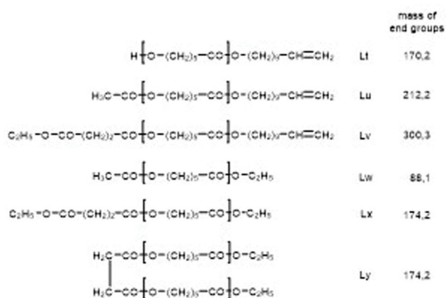
Scheme 5 Potential reaction products of the transesterifications of AcPCLUn with DESu catalyzed by neat TSA.

ratio of 2/1 was used corresponding to a 100/1 or 50/1 ratio of ethyl ester/undecenyl ester end groups. Due to this high molar ratio, almost all Ac and Un end groups were replaced by succinyl and ethyl end groups respectively. These data indicate, in turn, that intermolecular transesterifications were quite rapid and efficient even at 109 °C. The peaks of cycles were not detectable even in the ESI TOF mass spectra, a typical example of which is displayed in Fig. 8. In summary, all these transesterification experiments demonstrate that catalysis with TSA and with tin compounds agree in that intermolecular transesterification reactions are more efficient than equilibration via back-biting. In polymer melts intermolecular transesterifications may be slower than in the experiments with liquid esters conducted in this work. However, even when the efficiency of intermolecular transesterification is not higher than that of back-biting, the conclusions presented below are still valid.