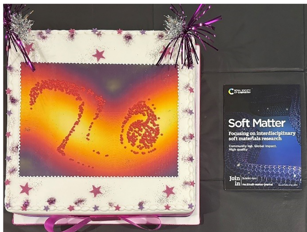
Fig. 2 Soft Matter 20th Anniversary cake (image from https://doi.org/10.1039/D5SM90056E ).