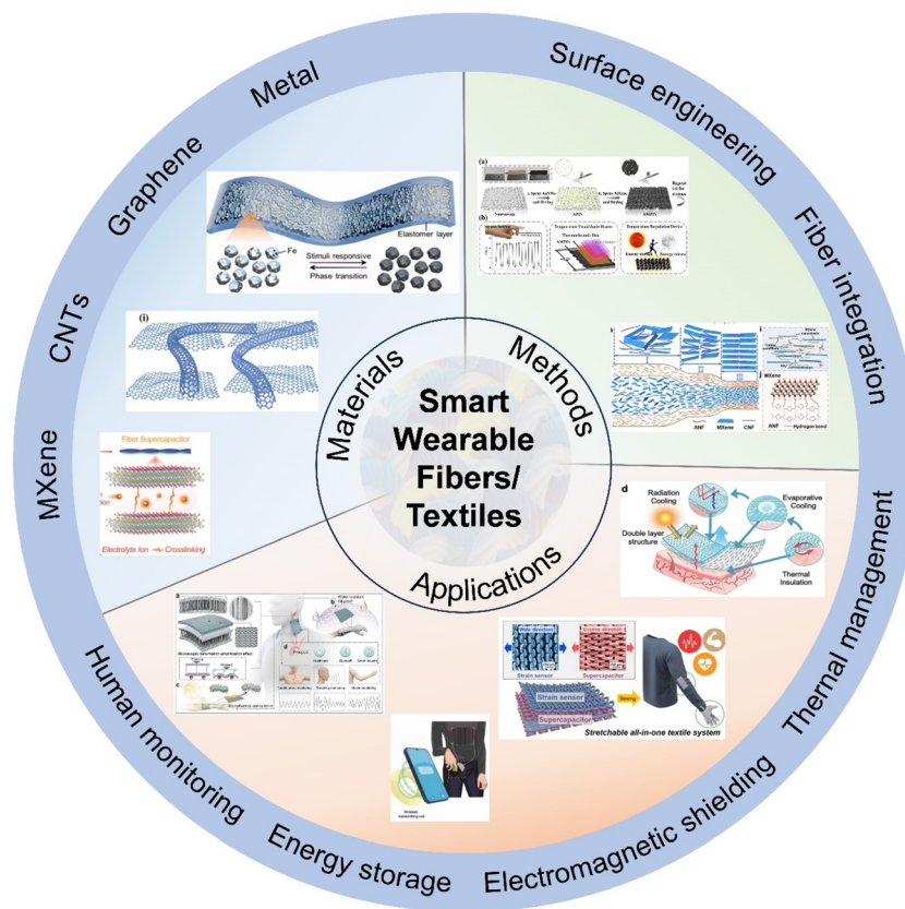
Scheme 1 Smart wearable fibers and textiles: status and prospects. Reproduced from ref. 46 with permission from American Association for the Advancement of Science, copyright 2024. Reproduced from ref. 50 with permission from Elsevier, copyright 2023. Reproduced from ref. 62 with permission from John Wiley and Sons, copyright 2025. Reproduced from ref. 57 with permission from American Chemical Society, copyright 2021. Reproduced from ref. 86 with permission from American Chemical Society, copyright 2019. Reproduced from ref. 102 with permission from John Wiley and Sons, copyright 2024. Reproduced from ref. 114 with permission from John Wiley and Sons, copyright 2022. Reproduced from ref. 118 with permission from Royal Society of Chemistry, copyright 2022.

thermal conductivity, chemical stability, and mechanical properties, they have received widespread attention in recent years. 21,23 Among them, one-dimensional (1D) CNTs and 2D graphene nanosheets have shown great potential in flexible and stretchable electronics and smart wearable textile products. 24