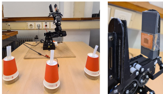
Fig. 6 Setup for tactile sensing experiment on robot arm.

Piezoelectric sensors can be used in many applications, including robotics and touch sensors for wearable devices. In this section, the fabricated piezoelectric sensor is attached to the