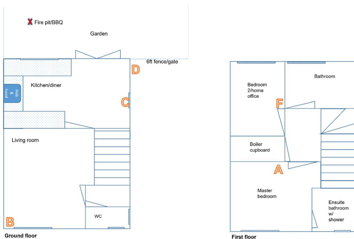
Fig. 1 Floor plan of house showing approximate sensor locations with sensor code associated with colocation period.

For the indoor units, the PMS5003 was not placed in an enclosure—the electronic housing protected the PCB and batteries only with the PMS5003 unit resting on top to sample.