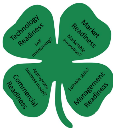
Fig. 5 A cloverleaf framework for market entry readiness assessment of nanotechnology inventions.

include an evaluation of the conceptual design, a clear protocol to facilitate a decision from among several competing design options, and similarly, a defined approach to decide when to begin full-scale development. These decisions might be made by the research team or they can be more complex and warrant an external, independent peer-review process. 20 Market readiness assesses how marketable the technology is; that is, how well the technology will be accepted by the target market. This is generally done by examining whether the technology offers meaningful identifiable and quantifiable benefits, has distinct advantages over competing products, has access to a market of a suitable size that is defined and is growing (demand-based), has immediate market uses, and has feasible manufacturing requirements. 21