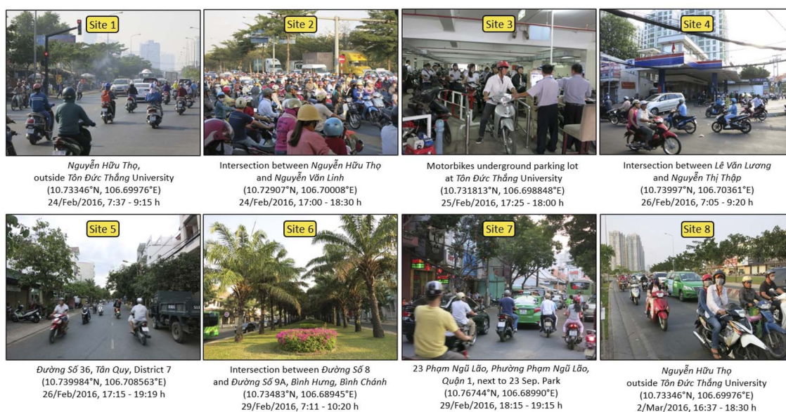
Fig. 1 Measurement sites. Except for site #3 that was only affected by motorbike emissions, all sites were also affected by emissions from passenger cars to a lesser extent. Large diesel trucks were only observed at site #2, and public buses at sites #4 and #7. Contributions from street food stalls and trash burning were experienced at all sites, to a greater extent at sites #1 and #8. The ESI includes a map (Fig. ESI1†) indicating the location of the measurement sites within HCMC urban sprawl.

(CO) mixing ratios were also measured as a tracer of traffic emissions during the street level measurements. We used relationships between pPAHs concentration and ASA as fingerprints of particles originated from combustion sources. 35,36 In addition to traffic particles, we saw that pedestrians and commuters were also exposed to cooking and biomass burning particles from street food stalls and trash burning, which were inherently included in the measurements. Similarly, assuming spherical particles, the concurrent and independent measurements of PN concentration and ASA were used to estimate the size of the particles by the diameter of average surface ( D_{Aver,S} ) as proposed by Kittelson et al. 37