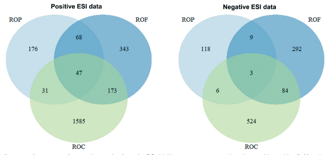
Fig. 2 Venn diagrams of non-target features in samples from the RO drinking water treatment plant detected in positive (left) and negative (right) electrospray ionisation (ESI) datasets. ROF: RO feed water; ROP: RO permeate; ROC: RO concentrate.