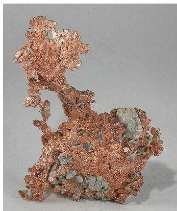
Fig. 2 The earliest metals to be utilized by man were those which occurred in the elemental form, such as copper.

copper age. Although relatively hard, pure copper itself is not hard enough to use for weapons or armour. For this development, a new technological innovation was needed – metallurgy and the isolation of elemental metals from their naturally occurring ores. Probably the first metal to be isolated by reductive pyrometallurgy was copper, most likely obtained from sulfide ores about 4000 BCE. The copper obtained from metallurgy sometimes had different properties to native copper; in particular, a much harder material was obtained from arsenic-containing ores, which we know now as the arsenic-bronzes. By refining mixtures of copper and tin ores, the harder and stronger tin-bronzes were obtained which allowed the manufacture of the new “superweapons” and the genesis of the bronze age 3500–1500 BCE. The near-contemporary epic poem, The Iliad , describes warfare using state-of-the-art bronze military technology. Although the tin-bronzes were extremely successful, they also represent a very early example of a technology limited by resource availability – tin ores were only found in very limited sites in the classical known world.