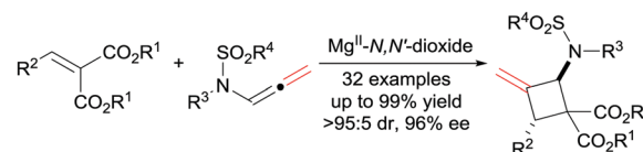
Scheme 1 The synthesis of heteroatom-substituted cyclobutanes and cycloaddition reactions of internal C=C of N -allenamides.

(c) The asymmetric synthesis of aminocyclobutanes via catalytic [2+2] cycloaddition of internal C=C of N -allenamides (this work)