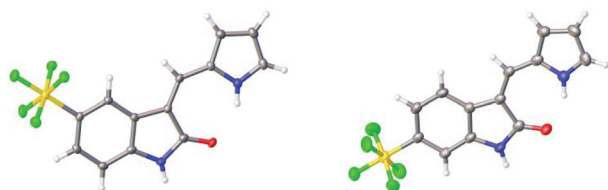
Fig. 3 Solid state structures of 10 and 11.

The related reaction with ferrocene carboxaldehyde afforded a mixture of stereoisomers 12a and 12b, which were