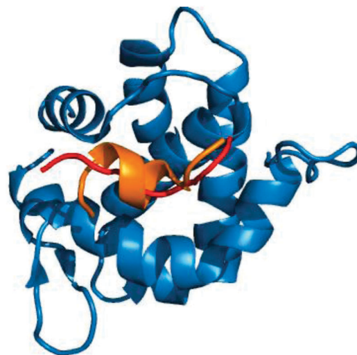
Fig. 6 The interaction of the E1A viral oncoprotein with a retinoblastoma protein is realized via an \alpha -helix and a turn secondary structure element (PDB code: 2r7g).

Owing to the genetic compaction of viruses, the encoded proteins should be involved in multiple functions, e.g. capable of establishing interactions with different partners. This could be facilitated by the underlying conformational heterogeneity of the viral proteins, which allows the ensemble to shift between different conformational states upon responding to different signals. Our results indicate that viral motifs have increased local flexibility or disorder relative to their 20AA flanking regions. We discussed examples for dynamic fuzziness, when the protein interconverts between multiple conformations in the bound state. 5,6 In the case of static fuzziness however, the ID protein folds upon interacting with the partner, but adopts alternative conformations. 5,6 17% of the human virus ELMs are located in ordered regions; these were analyzed for static fuzziness. To this end, we collected the structures of the host-virus complexes of these ELMs and different secondary structure conformations upon targeting the same host protein were identified (Table S5, ESI†). The adenovirus E1A protein interacts with a retinoblastoma