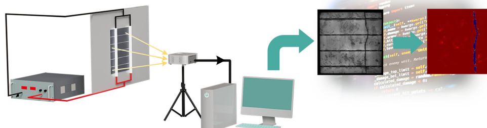
Fig. 1 PVEL image acquisition and machine learning-based defect segmentation.

End-to-end segmentation networks are task-optimized for accurate, dense defect detection of PVEL images. A GAN is used to produce more realistic reconstructions of normal samples through adversarial training. 42 However, GANs often suffer from training instability and typically require larger datasets, which limit their practicality in industrial settings. Different encoder-decoder NN architectures are also explored in PVEL image defect detection, including standard U-Net, 44,46 U-Net with an attention mechanism, 43 PSPNet 46 and DeepLabv3+. 46 Multiple combinations of encoder and decoder networks are explored, 45 which are Mobile-net, ResNet, VGG-net, and U-net