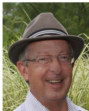
Bruce E. Dale

Lignocellulosic biomass, derived from a variety of plant sources that are abundantly available around the world, holds great potential as a sustainable feedstock for producing liquid