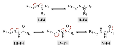
Fig. 4 Scheme showing the electron delocalization in alkyl and acyl hydrazones.

The hydrolytic cleavage of hydrazones groups is reversible. The hydrolytic stability of different structural hydrazone linkages was determined by NMR spectroscopy of the conjugates at different pH values. 32 The hydrolytic stability of hydrazone linkages with a positive charge on the nitrogen (trimethylhydrazoneium ion 6-T3 ) was higher than that for other hydra-