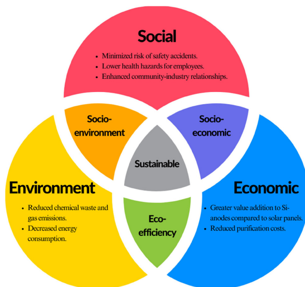
Fig. 3 Triple bottom line assessment Venn diagram.