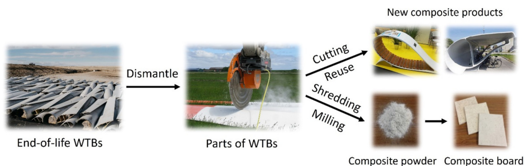
Fig. 4 Mechanical recycling processes of end-of-life WTBs.