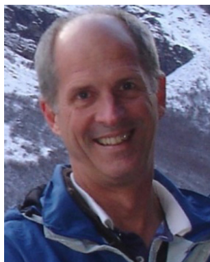
Michael N. R. Ashfold

The second class of experiments report directly on the velocities (and thus the translational energies) of one or more of the photofragments. Early photofragment translational spectroscopy (PTS) experiments used electron impact ionisation and mass spectrometric detection methods after the photofragments had recoiled along the detection axis. Current methods of choice 'tag' the fragment of interest immediately after its creation. Velocity map imaging (VMI) methods (Fig. 1) where the target photofragment is ionised at source (in a state-selective manner, by REMPI) and then accelerated onto a two-dimensional (2-D) time and position-sensitive detector, have had major impact in this field. 11-15 The image reports the velocity distribution of the probed fragment and, in favourable cases, shows structure which upon analysis reveals the quantum state population distribution in the partner fragment. A variant, that has been widely applied in studies of the photodissociation of hydride molecules that yield H