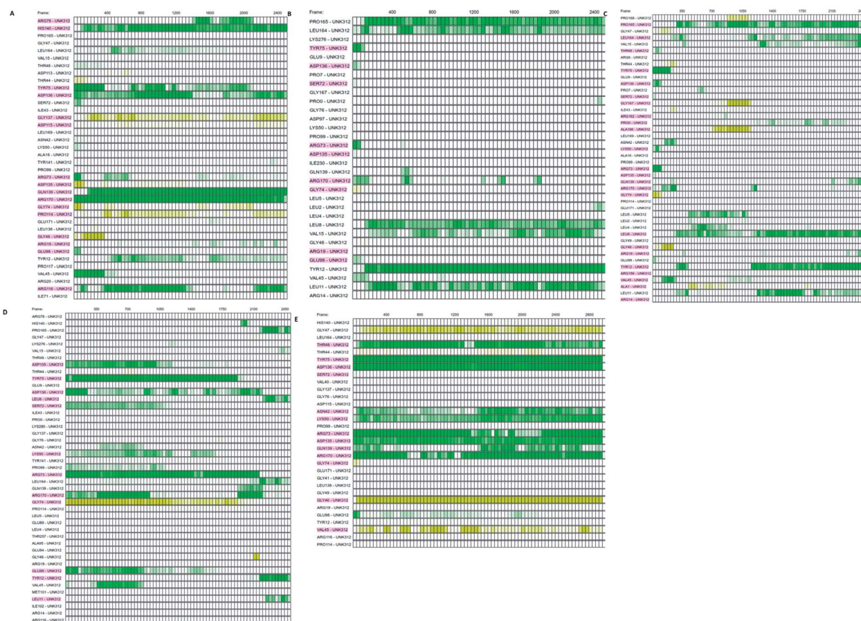
Fig. 19 The residues involved in hydrogen bond formation. (A) STOCK6S-33288, (B) STOCK6S-35740, (C) STOCK6S-39892, (D) STOCK6S-43621 and (E) IMMD30.

STOCK6S-43621 promote the conformational stability and probably due to more favorable interactions.