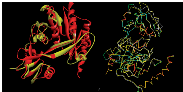
Fig. 5 Structural alignment of homology model and template structure (A) all atom alignment (B) C\alpha backbone alignment.

energies and with acceptable ADMET. The production phase 25 nanosecond MD simulations were carried out on remote server of the Bioinformatics Resources and Applications Facility (BRAAF), C-DAC, Pune. Gromos54a7 force field 73 was chosen to generate the topology of the protein while the ligand topologies were generated from ATB server. 74,75 The system was solvated using simple point charge (SPC216) model in a cubic unit cell the system and neutralized with addition of appropriate ions such as sodium and chloride. Steric clashes were removed through unrestrained energy minimization of the system with steepest descent criteria. Further, the system was equilibrated with constant volume and the pressure position restraint dynamics at constant temperature of 300 K for 100 picoseconds. The 25 ns production phase MD simulation was carried out with all covalent bonds restrained with the LINCS algorithm. 76 Particle Mesh Ewald method (PME) 77 was used to control the long range electrostatics such as Coulomb and Lennard Jones interactions with the cutoff value of 12 Å. The analysis of MD trajectories was carried out with respect to the root mean square deviations (RMSD) in the protein atoms and atoms in hit