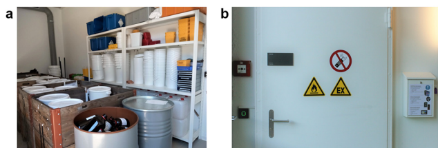
Fig. 4 Ventilated central storage for special waste, including nanowaste. a: Collection area for full nanowaste containers prior to pick-up by a treatment company. b: Example of a storage room built to comply with ATEX regulations (explosive atmospheres). Note the secure design (watertight floor, restricted access, device drop-off box for ignition sources).

All solid materials containing nanomaterials or hazardous chemicals must be disposed of in sealable, approved containers such as the plastic bins shown in Fig. 3a–c. Once the containers reach ~90% capacity, they must be sealed and transferred to a central special waste collection room (Fig. 4). Under no circumstances may solid nanowaste be discarded with ordinary household waste. Special solid waste includes any items that have come into contact with (bio)hazardous chemicals or nanomaterial powders or suspensions, such as empty chemical containers, disposable pipettes and tips, wipes, Petri dishes, chamber slides, microscope slides with