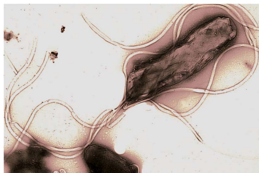
Fig. 2 Microscopic structure of Helicobacter pylori .

quad therapy, and sequential therapy. 39 Though these strategies have been effective in increasing the eradication rates, they are still accompanied by challenges like patient adherence to the prescribed medications, and possible side effects of the drugs. 40,41