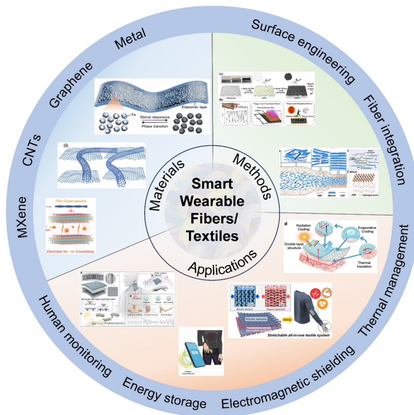
Scheme 1 Smart wearable fibers and textiles: status and prospects. Reproduced from ref. 46 with permission from American Association for the Advancement of Science, copyright 2024. Reproduced from ref. 50 with permission from Elsevier, copyright 2023. Reproduced from ref. 62 with permission from John Wiley and Sons, copyright 2025. Reproduced from ref. 57 with permission from American Chemical Society, copyright 2021. Reproduced from ref. 86 with permission from American Chemical Society, copyright 2019. Reproduced from ref. 102 with permission from John Wiley and Sons, copyright 2024. Reproduced from ref. 114 with permission from John Wiley and Sons, copyright 2022. Reproduced from ref. 118 with permission from Royal Society of Chemistry, copyright 2022.

thermal conductivity, chemical stability, and mechanical properties, they have received widespread attention in recent years. 21,23 Among them, one-dimensional (1D) CNTs and 2D graphene nanosheets have shown great potential in flexible and stretchable electronics and smart wearable textile products. 24