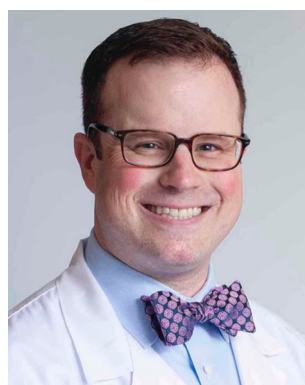
Russell W. Jenkins

Immune-competent murine tumor models remain the gold standard for most tumor immunology studies and are amenable to in vivo , ex vivo , and in vitro manipulation and iterative experimentation. 18 However, inbred murine tumor