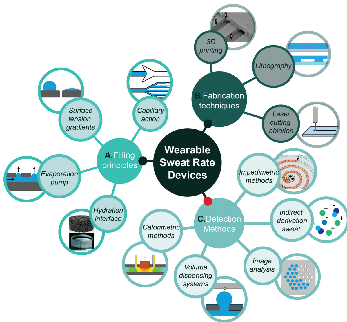
Fig. 1 Schematic overview of the A) filling principles, B) fabrication techniques and C) detection methods involved in the development of wearable microfluidic sweat rate devices. Reproduced with permission. 20–23 Hydration interface upper icon: Copyright 2024, Biomicrofluidics . Hydration interface lower icon: Copyright 2017, Lab Chip . 3D printing icon: Copyright 2017, Anal. Chem. Impedimetric methods: Copyright 2022, ACS Sens.

Recently, wearable sweat sensors integrating a means of measuring flow have been developed. To identify the most promising sweat rate sensor principles, it is valuable to investigate the currently used flow rate sensors and evaluate them on performance and efficiency. This review will focus on sweat rate sensing, by first providing insights into the relevance of measuring sweat rate, followed by common principles to determine microfluidic flow in a sweat patch.