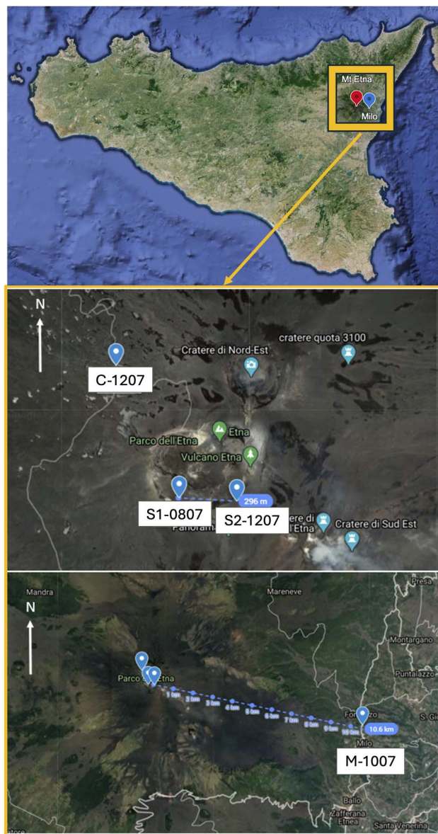
Fig. 1 Map of Sicily (top panel), filter sampling locations at the summit of Mt. Etna (middle panel) within (S1-0807 and S2-1207 sets) and upwind (C-1207 set) of the plume and filter sampling locations in the town of Milo (bottom panel) downwind of the plume (M-1007 set). The Mt. Etna summit is located at 37.7510° N, 14.9934° E and has an altitude of 3369 m.