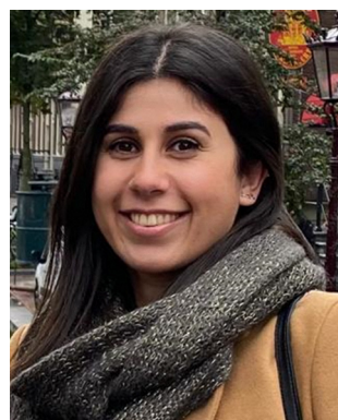
Sandy Al Bacha

† Electronic supplementary information (ESI) available: Comparison tables of the structural and physical properties of oxysulfide, oxyselenide and oxytelluride materials. Estimated band edge positions using the empirical method of different oxychalcogenides. See DOI: https://doi.org/10.1039/d5cc01448d