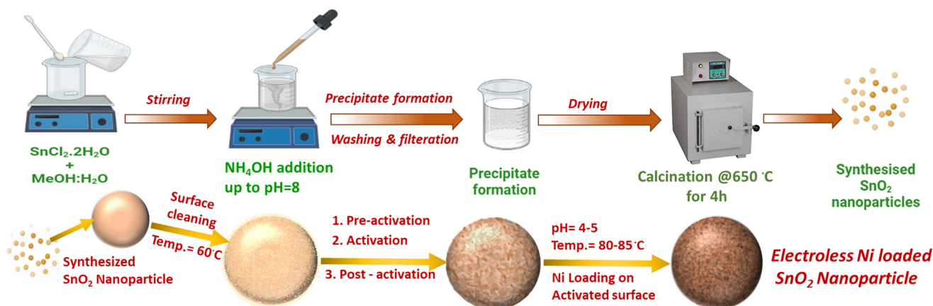
Fig. 1 Process schematic for the synthesis of SnO 2 nanoparticles and their electroless loading with Ni.

An IRAffinity-1S 01130 Shimadzu spectrometer was exploited for measuring Fourier transform infrared (FTIR) spectra between 400 and 4000 cm -1 . Morphological and microstructural investigations were performed using field emission scanning electron microscopy (FESEM, FEI NOVA NANOSEM 450) and field emission transmission electron microscopy (FETEM by JEOL, JEM-2200FS). For typical FETEM analysis, the test sample was carefully prepared by dispersing the sample powder in ethanol and then drop-casting it onto a carbon-coated grid. To obtain high imaging and spatial resolution with chemical mapping of the material, scanning trans-