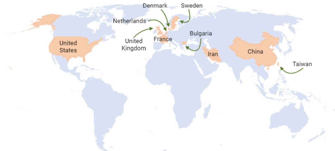
Fig. 5 Top ten countries with nanotechnology standards to date. 17,18 Original creation (using Excel and Biorender programs) based on information obtained from http://www.statnano.com (accessed on December 6th and 14th, 2023). 17,18

that some NMs have the same chemical formula as the other bulk materials; thus, NMs must be considered “new substances.” In this situation, the Royal Society and The Royal Academy of Engineering in the United Kingdom favoured treating chemicals in nanoforms as new substances under the Registration, Evaluation, Authorisation, and Restriction Chemicals (REACH) criteria. Similarly, The Danish Board of Technology (2006) proposed classifying NMs separately from existing chemicals. 135