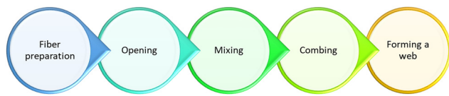
Fig. 3 Steps involved in the formation of nonwovens.

abbreviated workflow, as presented in Fig. 3. Remarkably efficient, nonwovens boast high production speeds (ranging from 10 to 300 meters per minute) and extensive automation, culminating in the manufacture of fibre-based products. Most nonwoven materials are disposable and single use produced with low-cost technologies. During the past several years, different technologies have been implemented in the fabrication of nonwoven fabrics, even though spun-bonding and meltblown are the most used techniques. 20