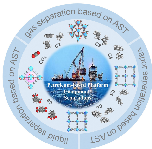
Fig. 2 Schematic diagram of metal-organic frameworks for the separation of multi-component petroleum compounds based on adsorptive separation technology.

an operation process in which a porous solid substance is contacted with a mixed component system (gas or liquid), and one or more components in the system are selectively attached to the solid surface, thereby realizing the separation of specific components.