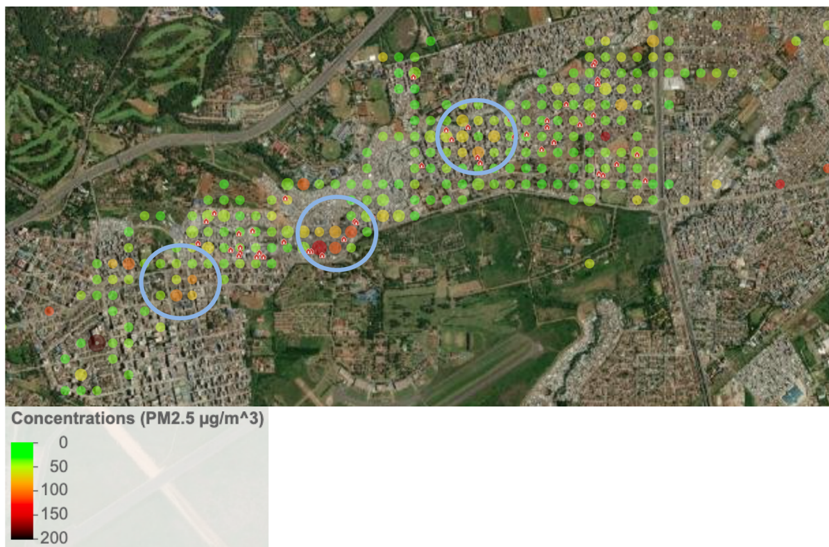
Fig. 4 Potential \text{PM}_{2.5} hotspots in the Starehe subcounty.