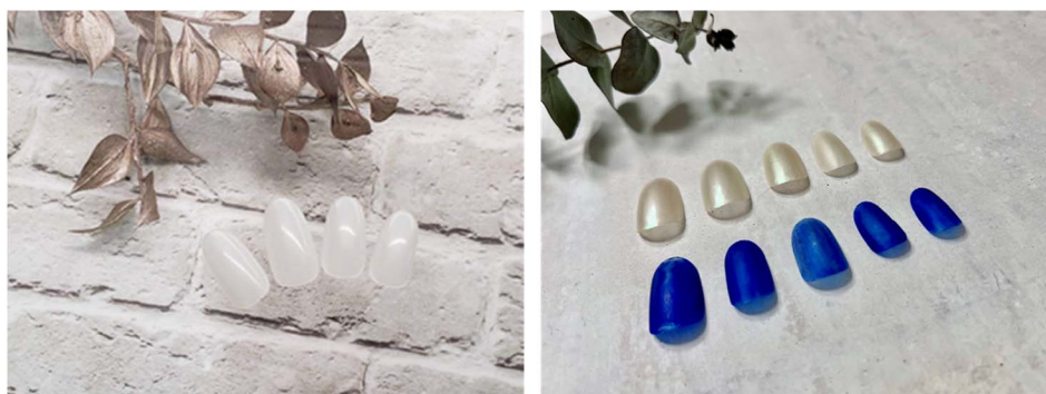
Fig. 17 100% biomass biodegradable fake (artificial) nail tips (Left) and water-based biomass nail polish (Right). 84,85

With the aim to create ultimate environmentally friendly products, 100% natural biomass biodegradable thermoplastic materials made from wood and stone were created (Fig. 18). A new material called a 'natural deep eutectic solvent' was applied to make this innovative material from wood and stone. The main feature is that it is 100% natural biomass and derived