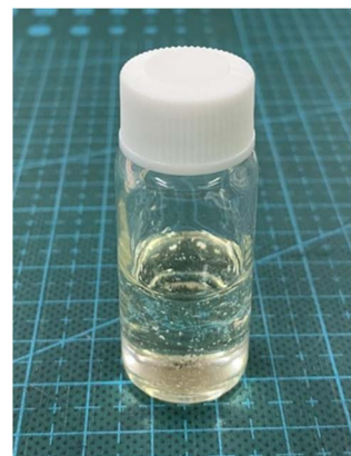
Fig. 30 Natural deep eutectic solvent-based lubricant with 100% biomass composition.

Alternatively, DESs have also been studied as a potential bio-based lubricant when they are composed of biomass-based chemicals. 138 Li et al. employed a betaine and sugar alcohol-based natural deep eutectic solvent as a lubricant. My group also had developed 100% natural biomass-based lubricants and cutting fluid using natural deep eutectic solvent technology (Fig. 30).