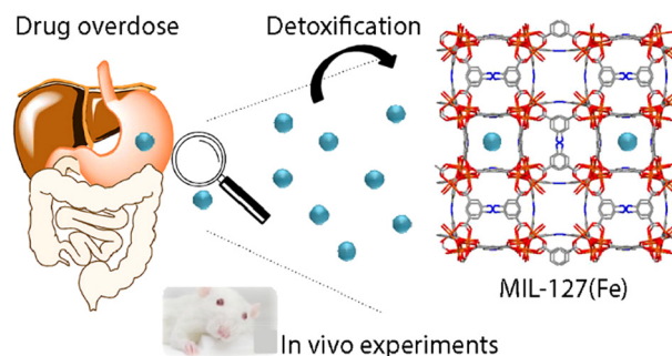
Fig. 18 Adapted with permission from ref. 134.