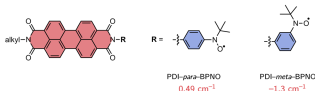
Fig. 3 Structures of the perylene diimide derivatives used for benchmarking and calculated values of J_{\text{TR}} using CASSCF/QD-NEVPT2.