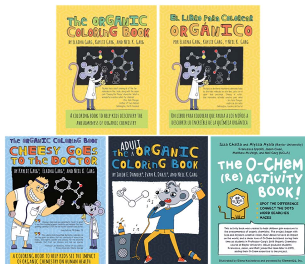
Fig. 5 The Organic Coloring Book series and The O-Chem (Re) Activity Book are designed to connect organic chemistry to the everyday lives of both children and adults.

The success of The Organic Coloring Book , as well as its medicine-themed sequel ( Cheesy Goes to the Doctor ), 23 led us to wonder whether we could develop similar resources to reach adults as well. Indeed, we felt that our motivations for creating the organic coloring book for children could also be extended to adults. As an example, “chemical-free” products are often marketed as desirable despite the impossibility of a product