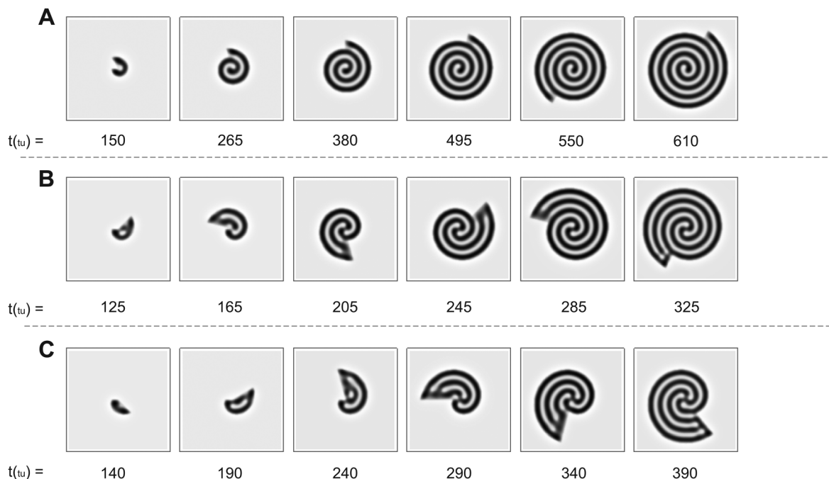
Fig. 3 Time evolution of Turing patterns on a rotating spiral growing domain for different (\dot{r}_T, \dot{\theta}_T, n_T) growth velocities obtained through numerical simulation of the Lengyel–Epstein model on a 80 \text{ su} \times 80 \text{ su} domain. (A) Single spiral obtained for n = 0.88 ( \dot{r}_T = 5.37 \times 10^{-2} \text{ su/tu} , \dot{\theta}_T = 3.0^\circ/\text{tu} ), (B) double spiral obtained for n = 2.22 ( \dot{r}_T = 0.134 \text{ su/tu} , \dot{\theta}_T = 3.0^\circ/\text{tu} ), and (C) triple spiral obtained for n = 3.55 ( \dot{r}_T = 0.107 \text{ su/tu} , \dot{\theta}_T = 1.5^\circ/\text{tu} ). Equivalent conditions to the results shown in Fig. 2.