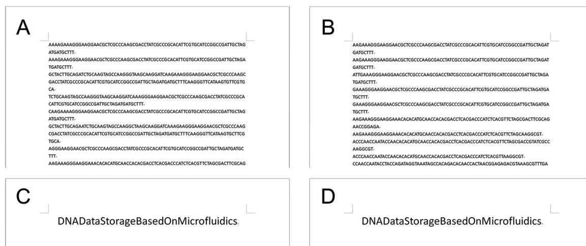
Fig. 5 Text information extraction from mineralized DNA data off-chip and on-chip. (A) The partial results of high-throughput sequencing (off-chip). (B) The partial results of high-throughput sequencing (on-chip). (C) The decoding text information from the results of high-throughput sequencing (off-chip). (D) The decoding text information from the results of high-throughput sequencing (on-chip).

by gel electrophoresis and high-throughput sequencing analysis. Gel electrophoresis images showed little difference between amplification products after purification, and some bands with longer lengths appeared in both, indicating DNA spliced during isothermal amplification (Fig. S12A † ). The high-throughput sequencing results showed that the target sequence read at a higher frequency with the shorter primers (Fig. S12B and C † ). We selected primer set one for DNA amplification in the proof-of-concept experiment.