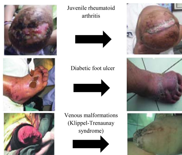
Fig. 3 Wound healing by coffee through human study. 81 Adopted with permission from ref. 81.

Histopathological studies on thirty-six New Zealand white rabbits supported the wound healing activity of green coffee bean extracts. Shahriari et al. 94 studied the green coffee bean extract in a full-thickness wound model. Coffee (10%) increased the wound closure rate, exhibited a shorter epithelialization