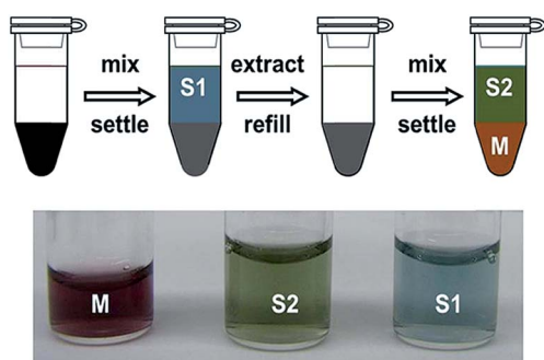
Fig. 6 (Top) Schematic of band gap fractionation of a SWCNT sample by sequential ATPE separations at successively reduced oxidant concentrations. (Bottom) Photographs of separated fractions isolated from a small diameter SWCNT population. Adapted with permission from Gui et al. , Nano Lett. , 2015, 15 , 1642–1646. Copyright 2015 American Chemical Society.

The second common implementation of ATPE is the competition of SDS and DOC to selectively partition SWCNTs on the basis of their structure. This selection is generally based on