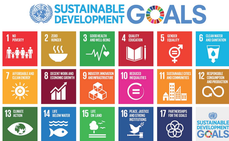
Fig. 1 The 17 SDGs of the UN, aimed at ending poverty, protecting the planet, and ensuring prosperity for all as part of the sustainable development agenda. Each goal has specific targets to be achieved over the period 2015–2030 ( http://www.un.org/sustainabledevelopment/sustainable-development-goals/ ). An 18 th SDG aimed at clean air should be added.

It is proposed here to adopt an additional SDG on “clean air”, at the same level as good health, clean water, sustainable industrialization and cities, responsible production, climate action, marine and terrestrial life (SDGs 3, 6, 9, 11, 12, 13, 14, 15, respectively), not only because ambient air pollution is the leading environmental risk factor of the global burden of disease, 8 but also because many other SDGs cannot be achieved without considering air quality. The next Section 2 focusses on results from the Faraday Discussion meeting Atmospheric chemistry in the Anthropocene , held in York, UK, from 22–24 May 2017, which presented scientific results that underpin this statement. Section 3 presents an update of the