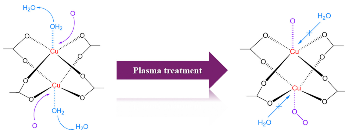
Fig. 7 Proposed \text{O}_2 plasma treatment mechanism of pore activation and protection.

The theoretical and practical aspects of the nucleation and crystal growth process of the DBD plasma-assisted MOFs synthesis method have been developed by scientists. In hydrothermal, as a conventional synthesis method, the heat increases with time, so the concentration of precursors reaches a certain level. At this point, crystals nucleate on dust particles or near the reactor walls. 73,74 However, in the DBD plasma-assisted method, a wide range of micro-discharge channels contain photons, active neutral particles, and charged particles that have been uniformly profiled on the surface of the solution film. The energy of the charged particles can be several electron volts (and the temperature in the channels is hundreds of Kelvin) due to the strong influence of the electric field. When these particles collide with the solvent, their energy is released, forming several localized superheat spots on the solution film surface. These superheat spots induced the reaction to form a precursor at atmospheric pressure and room temperature. Therefore, the precursor concentration increased with circulation, leading to nucleation growth and higher yields. 75