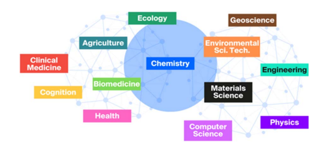
Fig. 1 Chemistry is usually depicted as "the central science". This simplified scheme depicts how chemistry is connected to many other fields based on the connectivity maps generated from bibliographical analyses (adapted from Rafols, Porter, and Leydesdorff, 2010).<sup>6</sup>

aromaticity.7 These results challenged the previous belief that carbon-carbon covalent bonds are immutable, opening doors to dynamic systems with interesting possibilities in the design of sustainable solutions, such as systems that actively adapt to the environment around them. Additionally, some of these molecules and materials could exhibit different behaviours based on external stimuli, "smart systems" with great potential in applications such as medicinal chemistry.8 Other opportunities include the design of molecules with features like sustainability already built-in chemists could create connections and design efficient "disconnections" that ensure efficient degradation to the original building blocks for recycling and upcycling.9 Similarly, organocatalysis (selected within the first IUPAC Top Ten list in 2019) is realising the potential of non-metallic compounds to catalyse enantioselective transformations efficiently and sustainably,10 supported by the award of the 2021 Nobel Prize in Chemistry to David MacMillan and Benjamin List. Currently, our chemical technologies transform only one-third of all raw materials into useful products - therefore, the vast majority is wasted. 11 New discoveries, such as dynamic bonds, could expand the toolbox of adaptive chemistry, a strategy that explores the potential of responsive materials to yield fascinating features such as self-